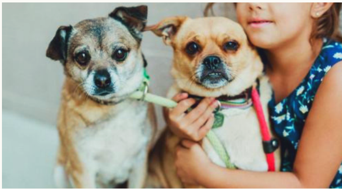
(Elliot - left; Cookie - right)

www.costamesaca.gov www.pricelesspetrescue.org