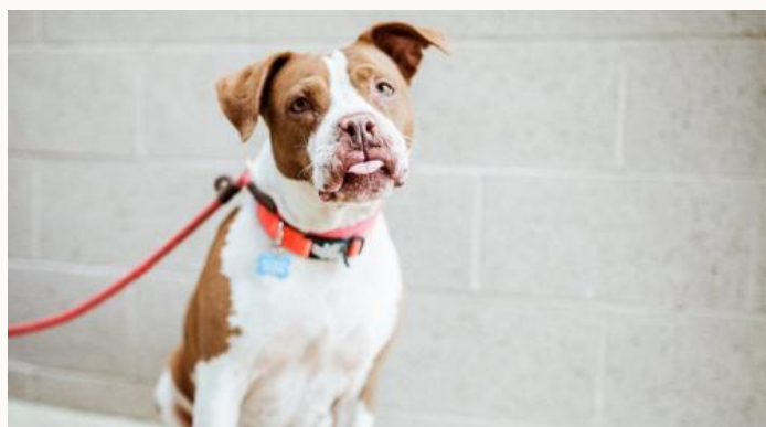
(Beauty,)

Maryland and her kittens recovered in foster care through Priceless Pet Rescue. The kittens have found their new homes and now it's mom's turn. If you are interested in adopting Maryland, please visit www.pricelesspetrescue.org .