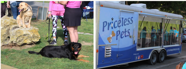
Above: Priceless Pet Rescue Pack Walk