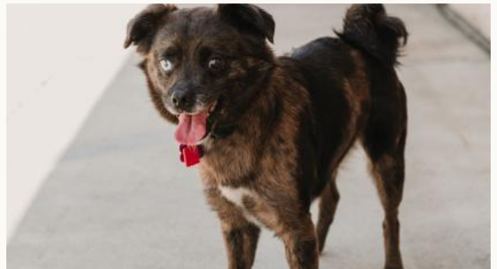
(Stanley,)

On her downtime, Cleo enjoys snuggling on her cat bed and dreaming of her new family. Her friendly nature will warm any home. If you are interested in adopting Cleo, please visit www.pricelesspetrescue.org .