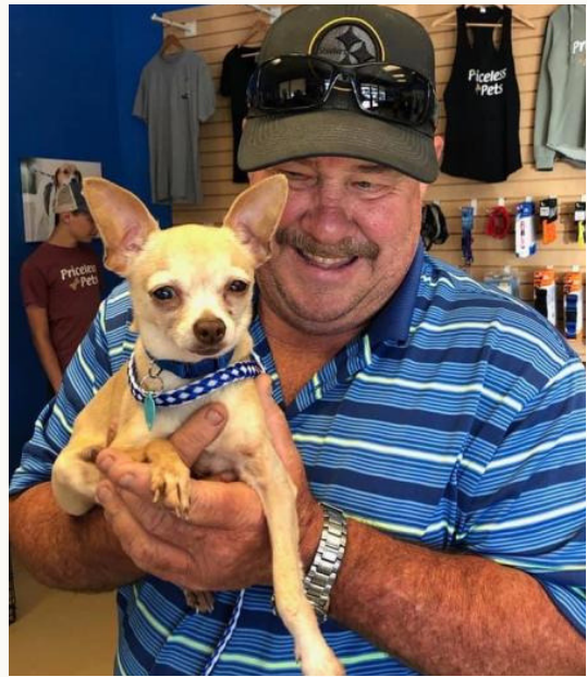
Above: Hope and her new owner

After weeks of recovery, Hope was then transferred to Priceless Pet Rescue. Hope spent time in foster care as she continued to recuperate and acclimate to her new surroundings. On July 3, Hope was adopted by her new family and added another chapter to her incredible journey.