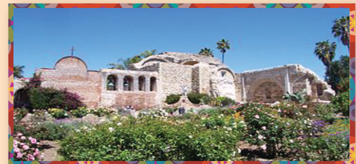
San Juan Capistrano