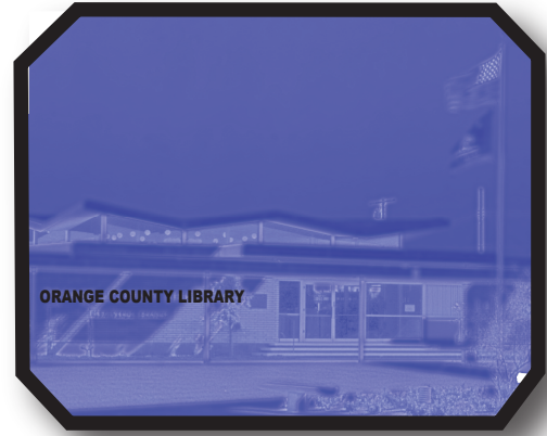
ORANGE COUNTY LIBRARY

FIND THEM ON THE MAP AND MATCH THE NUMBERS AND LETTERS.