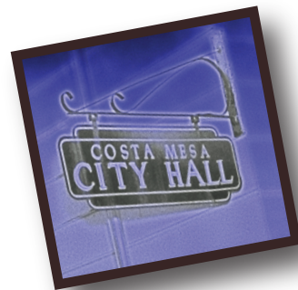
COSTA MESA CITY HALL