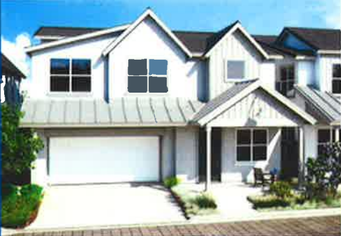
2157 Tustin Ave.