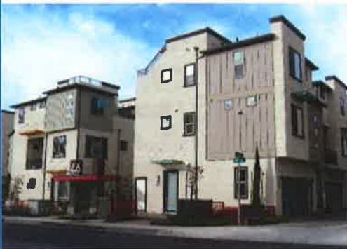
1036-1042 W. 18 th Street