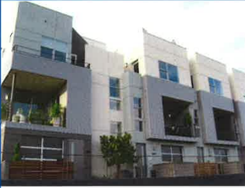
1527 Newport Blvd.

An Annual Review of the Costa Mesa 2000 General Plan