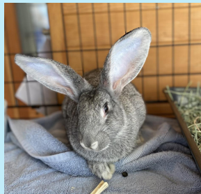
Sandy - Costa Mesa Location