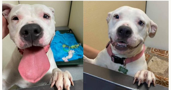
(Mimosa,)

Nova can't wait to find her forever home. For more information on how to adopt or meet Nova in person, please visit www.pricelesspetrescue.org .