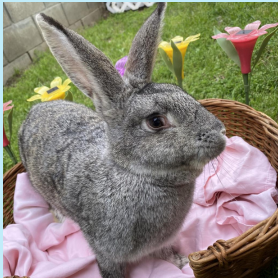
Big Mama - Costa Mesa Location

July is Adopt-a-Rescue-Rabbit Month! Check out the rabbits that are currently waiting for their forever home at www.pricelesspetrescue.org .