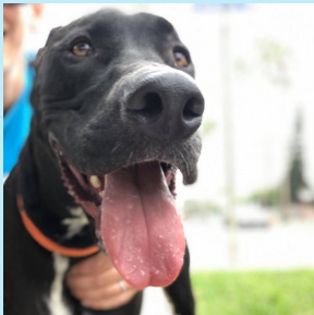
Enzo - Costa Mesa Location

October is Adopt-a-Shelter Dog Month! Check out the dogs that are currently waiting for their forever home at www.pricelesspetrescue.org .