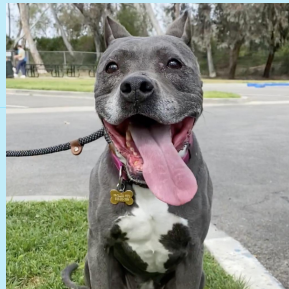
Blue - Clairmont Location