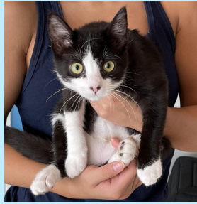
Oliver - Costa Mesa Location