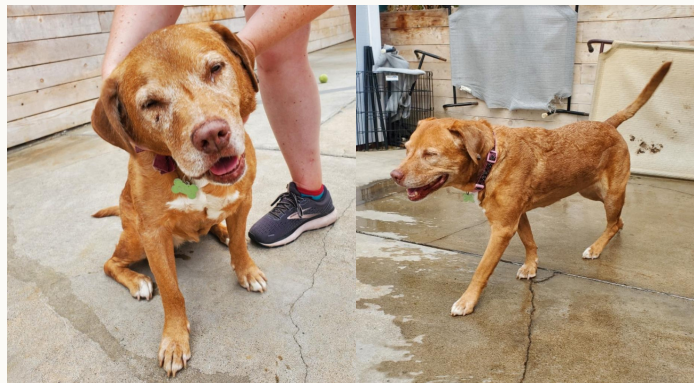
(Queen,)

Leela can't wait to find her forever home. For more information on how to adopt or meet Leela in person, please visit www.pricelesspetrescue.org .