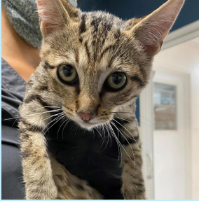
Howl - Costa Mesa Location

September is Cat Month! Check out the cats that are currently waiting for their forever home at www.pricelesspetrescue.org .