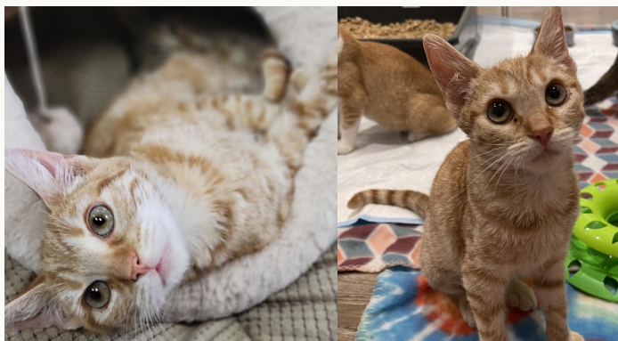
(Leela, pictures courtesy of Priceless Pet Rescue)

www.costamesaca.gov/pets www.pricelesspetrescue.org www.newportcenterah.com