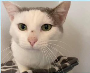
Albus - Costa Mesa Location

December is National Cat Lovers Month! Check out some amazing cats who are currently waiting for their forever home at www.pricelesspetrescue.org .