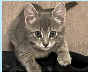
Bia Louisa - Costa Mesa Location