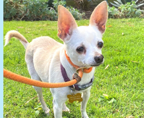
Tracy - Costa Mesa Location