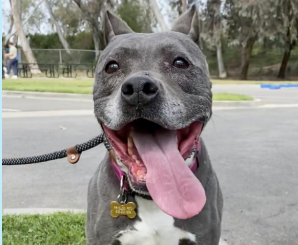
Blue - Claremont Location

November is Adopt a Senior Pet Month! Check out the senior pets who are currently waiting for their forever home at www.pricelesspetrescue.org .