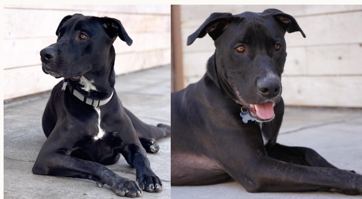
(Enzo, pictures courtesy of Priceless Pet Rescue)

Aurora first arrived to us in late August and is eagerly awaiting her adoption day. For more information on how to adopt or meet Aurora in person, please visit www.pricelesspetrescue.org .