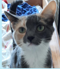
Moon- Costa Mesa Location

Check out these pets that are currently waiting for their forever family at www.pricelesspetrescue.org .