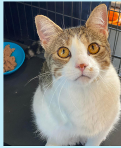
Ammo - Costa Mesa Location

Check out these pets that are currently waiting for their forever family at www.pricelesspetrescue.org .