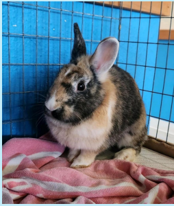
Toffee - Chino Hills Location