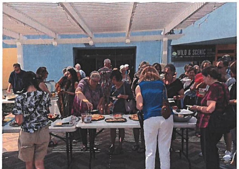
Guests, local environmental groups, and filmmakers meet and mingle in courtyard reception from 2022 Orange Coast Wild & Scenic Film Festival.