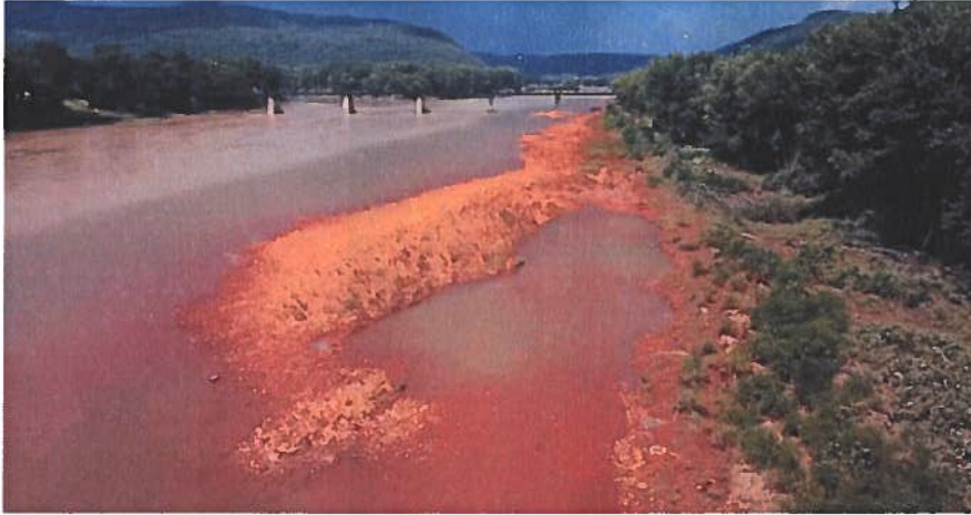
A still from the film "A River Reborn" shows Pennsylvania's Little Conemaugh River, polluted by now-abandoned coal mines.

She cited the creation of the California Coastal Act in 1976 and the formation of the Banning Ranch and Bolsa Chica conservancies as examples of citizens banding together to make huge environmental changes.