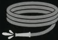
HOSES, CORDS AND WIRES