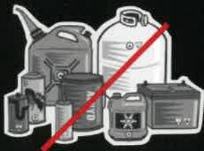
NO HAZARDOUS MATERIAL