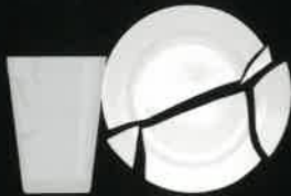
BROKEN GLASS/ CERAMIC