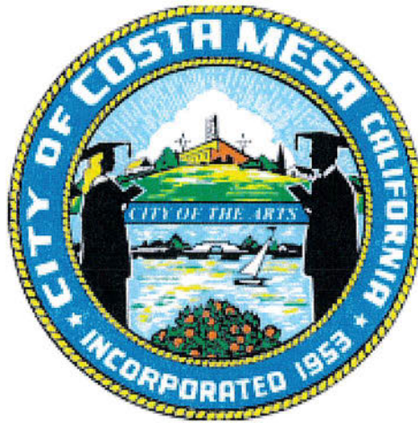
EXHIBIT B ARTIST'S PROPOSAL & ATTACHMENTS