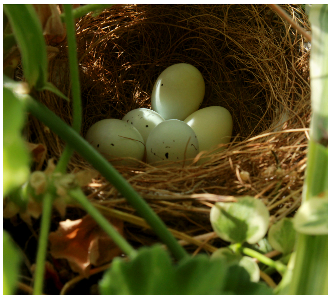
NEST HIDDEN IN VEGETATION ON THE GROUND