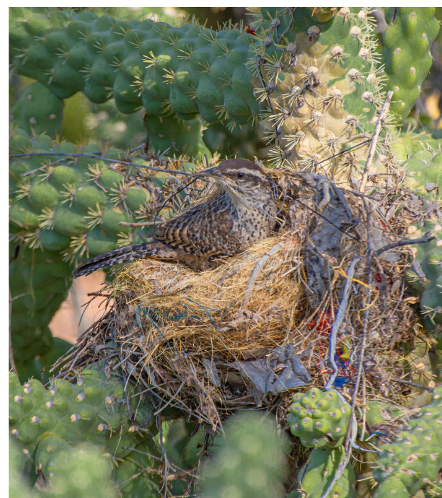
NEST HIDDEN IN CACTI SCRUB